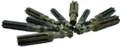
EnduroSharp® Torlon® Adhesive Reamer (TAR)

Item Numbers: TSB-170, TSB-230, TSB-500, TSB-750, TSB-1200