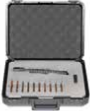
EnduroSharp® Scraper Blade & Holder Kit

EnduroSharp® Scraper Blade & Holder kits are equipped to offer you the essentials when using the scraper blade to remove adhesive. The kit comes complete with a standard scraper blade holder, pocket handle, and 10 EnduroSharp® Torlon® Scraper Blades (2 of each size: TSB-170, TSB230, TSB-500, TSB-750, and TSB-1200).