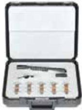
EnduroSharp® Gap Blade & Holder Kit

EnduroSharp® Gap Blade & Holder kits are equipped to offer you the essentials when removing gap filler materials. The kit comes complete with a standard scraper blade holder, pocket handle, and 15 EnduroSharp® Torlon® (1 of each size: TGB-75-75, TGB-75-16, TGB-75-25, TGB-10-75, TGB-10-16, TGB-10-25, TGB-12-75, TGB-12-16, TGB-12-25, TGB-17-75, TGB-17-16, TGB-17-25, TGB-23-75, TGB-23-16, and TGB-23-25).