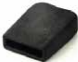
EnduroSharp® "Pocket" Scraper Blade Holder

EnduroSharp® "Pocket" Scraper Blade Holder is for use with EnduroSharp® Torlon® Scraper Blades and EnduroSharp® Torlon® Gap Blade Adapter.