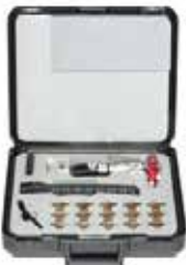
Deluxe EnduroSharp® Gap Blade & Holder Kit with Pneumatic Tool

Deluxe EnduroSharp® Gap Blade & Holder with Pneumatic tool kits are equipped to offer you everything you need when removing gap filler materials. The kit comes complete with a Pneumatic tool, standard scraper blade holder, pocket handle, and 15 EnduroSharp® Torlon® (1 of each size: TGB-75-75, TGB-75-16, TGB-75-25, TGB-10-75, TGB-10-16, TGB-10-25, TGB-12-75, TGB-12-16, TGB-12-25, TGB-17-75, TGB-17-16, TGB-17-25, TGB-23-75, TGB-23-16, and TGB-23-25).