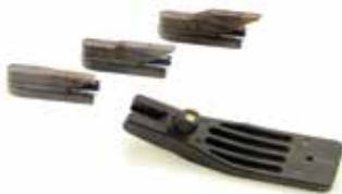
EnduroSharp® Torlon® Gap Blades (TGB)

Item Numbers: TACS-C-1, TACS-C-2, TACS-C-3, TACS-C-4, TACA-C-, TACA-C-2