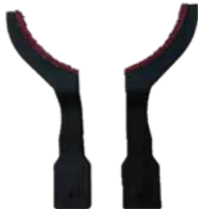
EnduroSharp® C-130 Prop Hub Abrasion Pads

Item Number: NAT-AP-CR3, NAT-AP-CR4, NAT-AP-CR5, NAT-AP-CR6