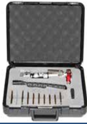
Deluxe EnduroSharp® Scraper Blade & Holder Kit with Pneumatic Tool

Deluxe EnduroSharp® Scraper Blade & Holder with Pneumatic tool kits are equipped to offer you everything you need when using the scraper blade to remove adhesive. The kit comes complete with a Pneumatic tool, standard scraper blade holder, pocket handle, and 10 EnduroSharp® Torlon® Scraper Blades (2 of each size: TSB-170, TSB230, TSB-500, TSB-750, and TSB-1200).