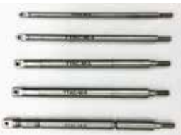
EnduroSharp® Tertherable (segmented) Mandrels

Item Numbers: STAC-M-3, STAC-M-4, STAC-M-5, STAC-M-6