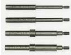
EnduroSharp® Standard (non-segmented) Mandrels

EnduroSharp® Standard (non-segmented) Mandrels are used with Torlon® Adhesive Cutter Blades (mandrel mounted). The mandrels can be used in a variety of electric (corded and battery powered) and pneumatic drills rated at 600 rpm or less.