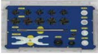
EnduroSharp® Andrew Tool Torlon® Adhesive Cutter (TAC) Kit

EnduroSharp® Andrew Tool Torlon® Adhesive Cutter (TAC) Kit contains 10 EnduroSharp® Torlon® Adhesive Cutters (5 of each size: TACA-C-1, TACS-A-2) 4 Locating Buttons (1 of each size: ATC00254D-191, ATC00254D-250, ATC00254D-312, ATC00254D-375) 2 Quick Change Bushing (ATC00483 and ATC00484), 1 Torlon® Adhesive Cutter Adapter, 1 Alignment and Spindle Lock Tool, and 1 Multi Wrench.