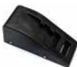
EnduroSharp® Scraper Blade Sharpener

EnduroSharp® Scarper Blade Sharpener is a durable hand-held portable sharpening fixture used to sharpening the EnduroSharp® Torlon® Scraper Blades. The sharpener along with 120-180 grit sand paper, allows for quick sharpening of the Torlon® Scraper Blade, while maintaining the 25°/25° asymmetrical 1/3-2/3 cutting edge. The simplistic compact design enables the operator to sharpen the Torlon® Scraper Blade while on the job site without the need for additional support items.