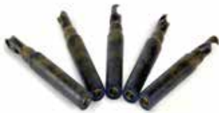
EnduroSharp® Torlon® Gap Filler Removal (GFR) Bits

Item Numbers: TGB-75-75, TGB-75-16, TGB-75-25, TGB-10-75, TGB-10-16, TGB-10-25, TGB-12-75, TGB-12-16, TGB-12-25, TGB-17-75, TGB-17-16, TGB-17-25, TGB-25-75, TGB-25-16, TGB-25-25