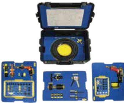
EnduroSharp® Surface Prep Kit

Adhesively bonded nutplates are increasingly being utilized in the manufacture of aerospace structures, with extensive use in securing removable maintenance access panels. When a nutplate fails, it can take an excessive amount of time to replace, resulting in undesirable aircraft down-time. Performance Plastics, in partnership with various suppliers, has devolved a suite of tools (EnduroSharp® Surface Prep Kit) to assist aircraft maintainers in quick removing the residual adhesive/sealant on the aircraft structure (remnants from a failed nutplate) and preparing the surface of the aircraft structure and the new replacement nutplate for bonding.