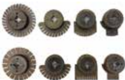
EnduroSharp® Torlon® Gap Filler Removal (GFR) Discs

EnduroSharp® Torlon® Gap Filler Removal (GFR) Discs are designed for use with a pneumatic tool. The tools provide aerospace maintenance professionals with an effective method of safely removing flexibilized epoxy gap materials as well as cutting or scoring thick elastomeric coatings without damaging composite substructures.