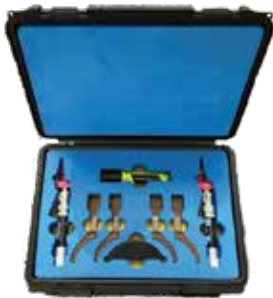
EnduroSharp® C-130 Prop Hub Adhesive Material Removal

EnduroSharp® C-130 Prop Hub Adhesive Material Removal Kit comes complete with case with custom foam inserts that contains: 2 each pneumatic tools, 1 each Class I, Division 2 flash light, 1 each contoured sharpening fixture (requires 120 - 180 grit abrasive paper, sold separately) and 4 each EnduroSharp® Torlon® Scraper Blades (2 each left hand and 2 each right hand).