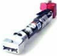
EnduroSharp® Standard Scraper Blade Holder

EnduroSharp® Pneumatic Removal Tool operates at a pressure of 90 psi (Max). For use with EnduroSharp® Torlon® Scraper Blades and EnduroSharp® Torlon® Gap Blade Adapter. Swivel Air Regulator fitting to prevent quick disconnect fitting galling and provide dial adjustment air flow regulation.