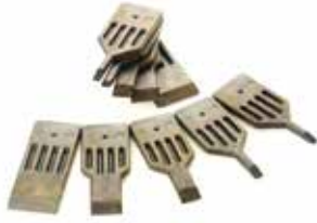
EnduroSharp® Torlon® Scraper Blades (TSB)

EnduroSharp® Torlon® Scraper Blade (TSB) inserts are designed for use with an ergonomically-designed handle sold separately or as part of a kit. The tools provide aerospace maintenance professionals with an effective method of safely removing gap materials, sealants and adhesive materials from underlying substrates and fasteners without damaging composite substructures.