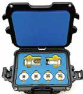
EnduroSharp® Nutplate Abrasion Tool "NAT"

EnduroSharp® Nutplate Abrasion Tool, "NAT" consist of 1 aluminum upper handle (top), 1 aluminum lower handle (base) and 4 nutplate base inserts (CR3, CR4, CR5, and CR6). Each nutplate base insert requires use with abrasive pads (sold separately). The NAT is used to abrade bond surfaces of CR series adhesively bonded nutplates. The rugged case comes with a high-density custom foam insert for easy inventory and protection.