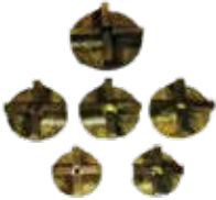
EnduroSharp® Torlon® Adhesive Cutter (TAC)

Item Numbers: TAR-190, TAR-2155, TAR-250, TAR-2755, TAR-313, TAR-3375, TAR-3615, TAR-375, TAR-4005