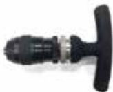
EnduroSharp® Ratcheted T-Handle

EnduroSharp® Ratcheted T-handle is for use with standard and segmented mandrel and the EnduroSharp® Torlon® Adhesive Reamers.